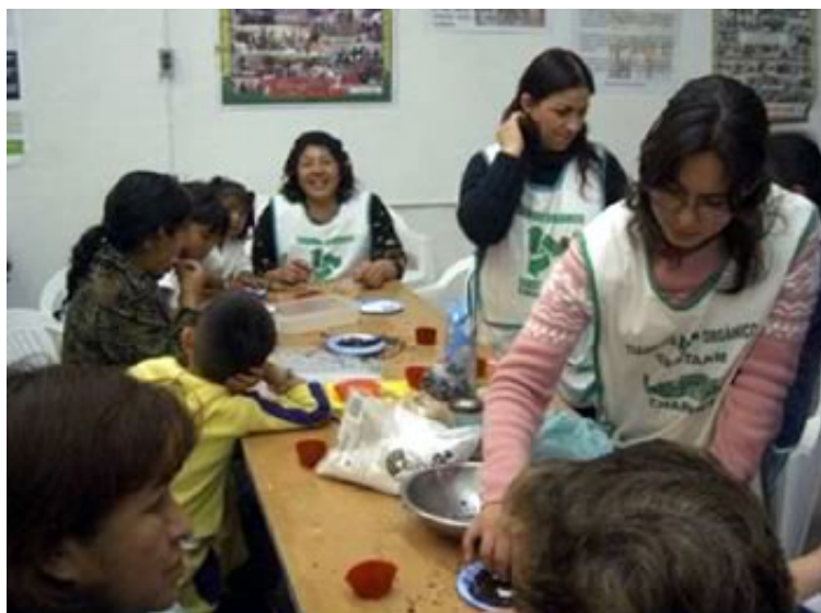
(Workshop with kids, making organic chocolates.)

Today, the Chapingo Organic Market opens every Saturday from 10am to 3pm and has more than 21 participating vendor tables. There are a growing number of consumers who come from the surrounding communities and also, in many cases, from Mexico City, which is about an hour's drive away. The products offered include fruits and vegetables, meats, dairy products, eggs, baked goods, honey, coffee, processed goods such as syrups, oils, salsas and dried fruits, biodegradable cleaning and beauty products and artisan work. In addition, consumers can enjoy a brunch of tlacoyos, quesadillas or tamales and drink a coffee, chocolate or hibiscus juice. The market does not just offer goods for sale – it also has a small library with books about environmental and organic agriculture issues, an information table with books and pamphlets, and a space to hold free educational workshops for children and adults.